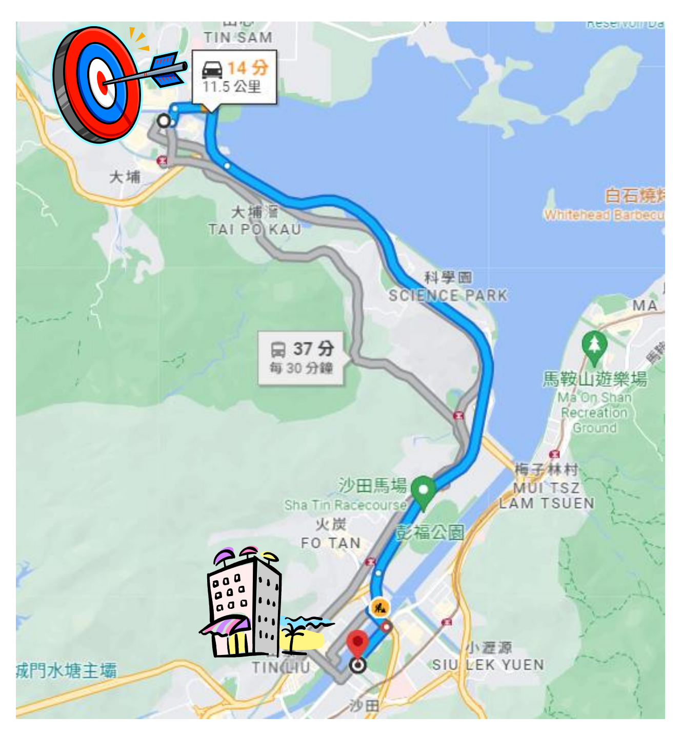
MAP (To show the distance between Hotel to Sports Centre)